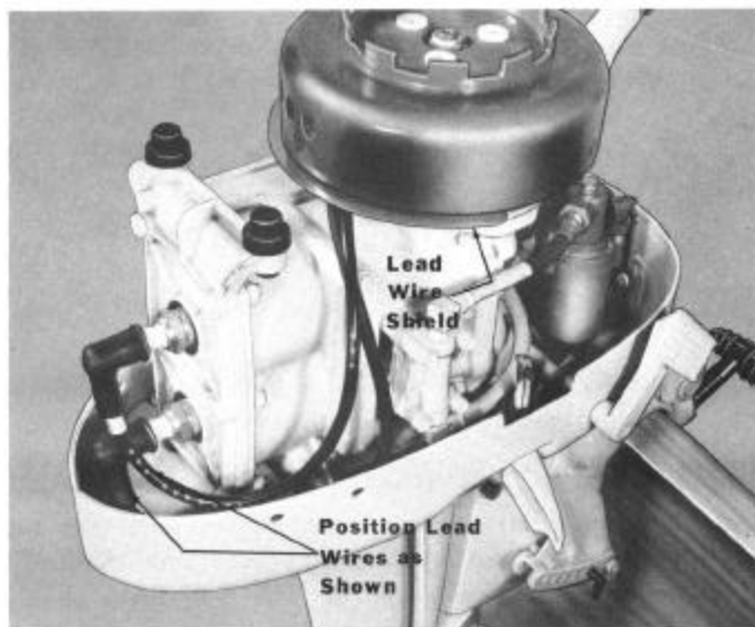
Figure 12. Spark Plug Leads Installed

35599A1 Lead Wire Shield Assembly for Merc 110-60 (Includes One 35599 Shield, Two 10-34695 Screws & Two 13-26996 Lockwashers)